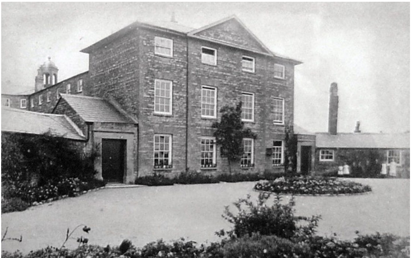
Bicester Workhouse, where the bell was last used.