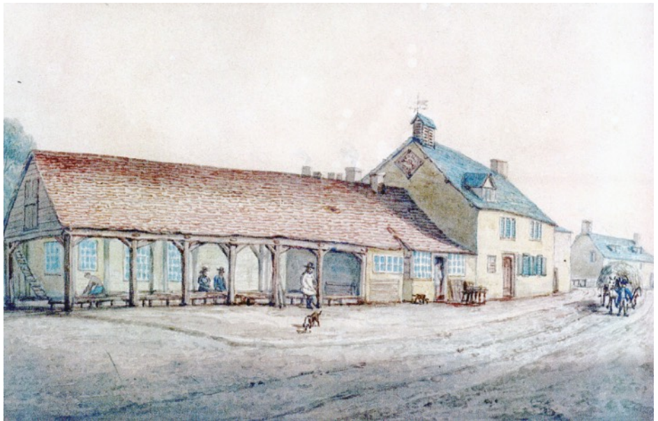
Town House and Shambles, in Market Square. The original home of the bell.