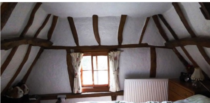
Interior of the Queens Head