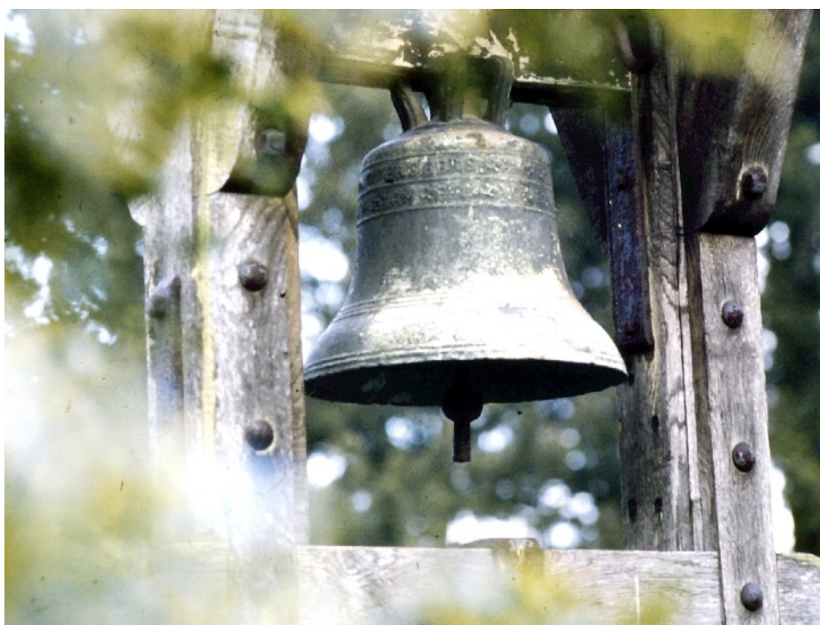
The town house bell now hangs in the grounds of the Garth. Pictured here in the 1970s.