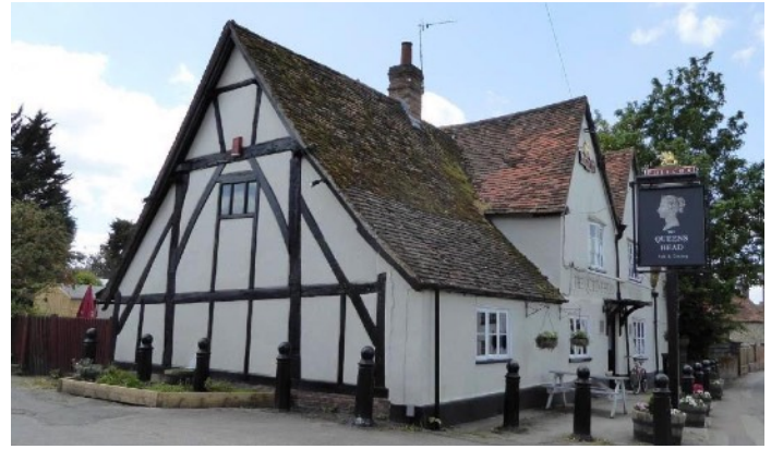
The Queens Head, Crowmarsh Gifford

Roofing construction and the materials used for covering the timbers are a good guide to the history of the building. Timber was always used to support the roof but the use of straight(ish) tree branches for the rafters rather than straight sawn timbers, indicates an earlier construction. The pitch of the roof is important as a modern tiled roof sitting on an old stone building with a steep pitch, usually indicates an earlier thatched roof (needed to shed the water more efficiently).