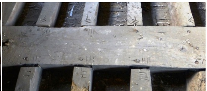
Carpenter's marks on floor joists. Off-site manufacture with the numbers aiding reassembly on-site.