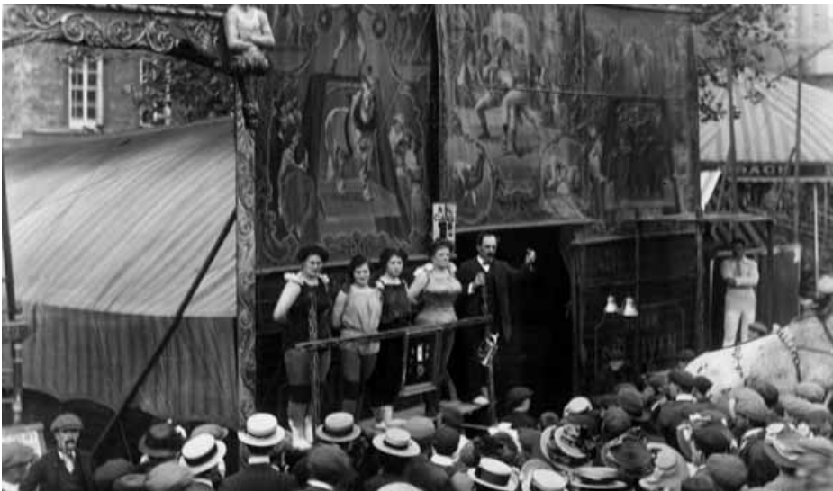
Female wrestlers at St Giles' fair - 1909

As you may have seen from the recent notices sent out to members, we have arranged a guided walk around central Oxford with Liz Woolley for Saturday 28th September.