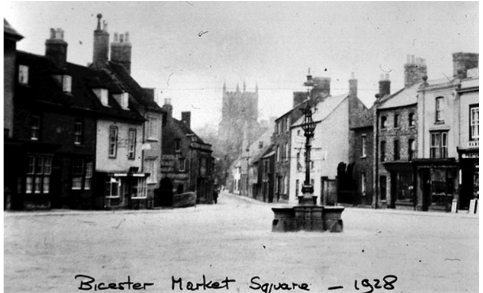
Bicester Market Square - 1928

made 1929 the first election where women were fully able to vote, and consequently it became known as the "Flapper Election".