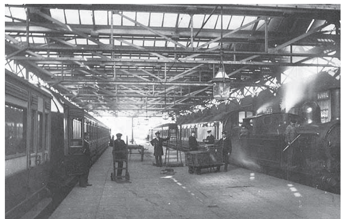
Western Road. A single track then continued north to the