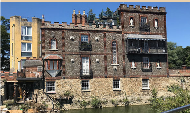
Caudwell's Castle, on Folly Bridge Island (built in 1849)