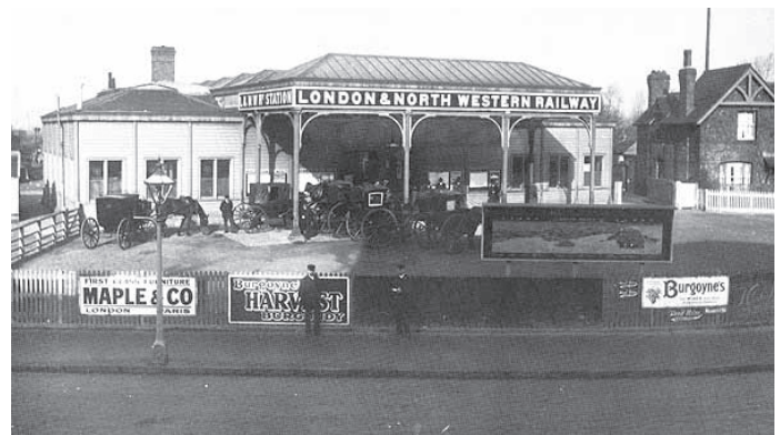
Rewley Road Station in 1914

The line came along what is now Marlborough Road, with the station located around the junction with