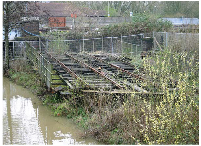
The swing bridge

The new station remains as Oxford's only central station today. It originally had an overall roof, but this was removed in 1891, when the station was remodelled, and replaced with short awnings that just covered the platforms, as still remain today.