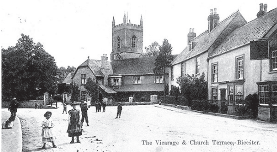
The Vicarage & Church Terrace, Bicester.