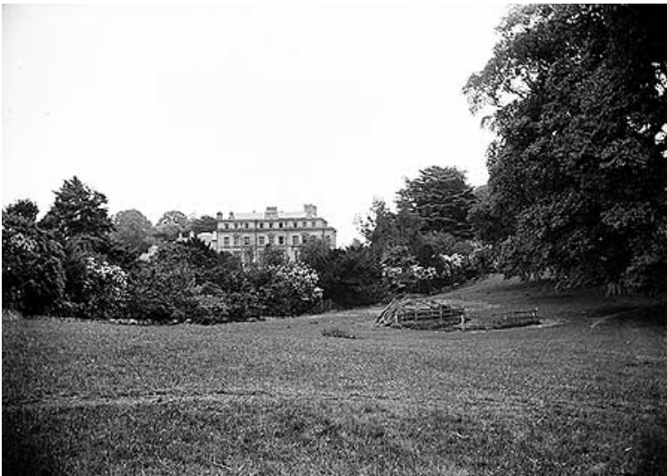
The 1875 manor house, photographed in 1901