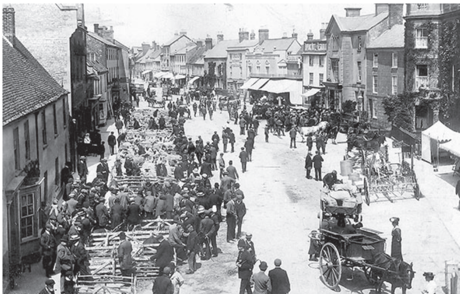
Sheep Fair in Sheep Street - 1908