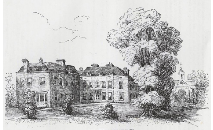
The 18th century manor house, demolished in 1875

In the 18th century the house was enlarged and plantations made to improve its parkland. But in 1875 the house was almost completely demolished and