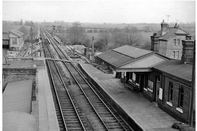
Bletchingdon Railway Station - 1961

From 1845 the Oxford and Rugby Railway ran through the hamlet and in 1850 Bletchingdon railway station was built there. British Railways closed the station in 1964 but the line remains open as part of the Cherwell Valley Line.