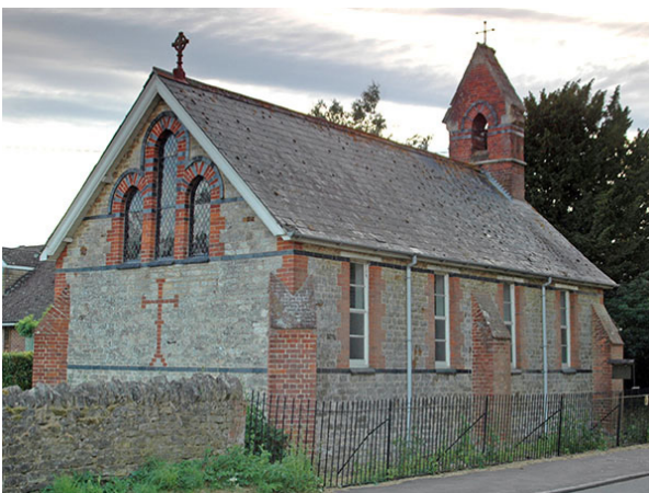
Murcott Mission Room

In 1542 the Crown granted most of the land at Murcott to the Dean