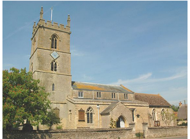
St Mary the Virgin Church