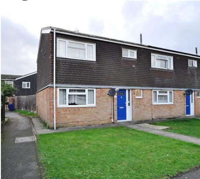
Some of the Leach Road houses, close to where the two boys died.

The Coroner said that it was only too clear what had happened. He directed the