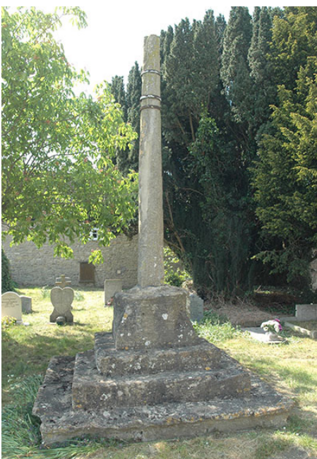
The village's 13th century preaching cross