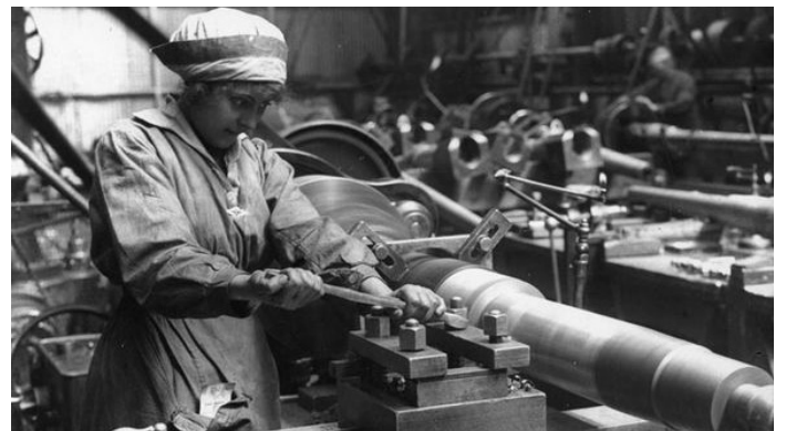
A woman at work in an armaments factory.

The Order of the White Feather formed in late