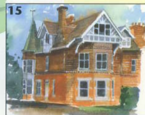
The Garth. This house was built as a hunting box by the Keith-Falconer family who were members of the Bicester hunt. The grounds contain a cemetery for horses and hounds. Now the offices of Bicester Town Council.