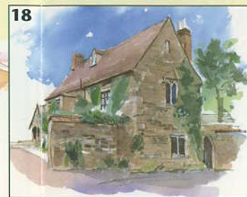
The Old Priory. This house was rebuilt sometime after 1587 on the site of the Priory guesthouse. It contains reused medieval masonry.