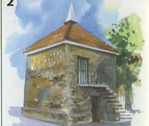
The Dovecote. A 17th century structure for keeping pigeons for the table. It stands in the centre of what was the the main courtyard of the medieval Priory.