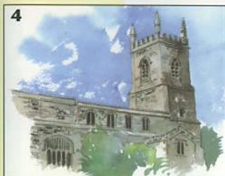
St Edburghs Church. This Church was founded as a Saxon Minster. It was rebuilt and extended between the 11th and 14th Centuries.