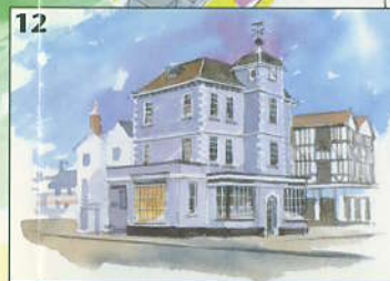
Market Square. Not a square but a triangle. Commercial heart of the Town and site of the market since 1239. The island buildings in the centre were built by wealthy townspeople in the 16th and 17th centuries.