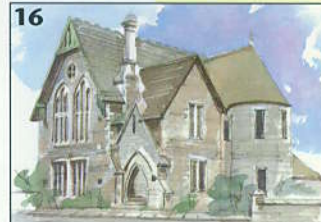
St Edburghs Hall. A Victorian Gothic Church Hall