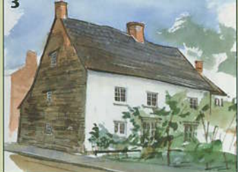
Old Place Yard House. This 16th century farmhouse was converted from the entrance gatehouse of the Priory.