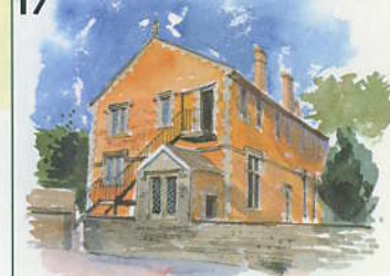
The Priory. Site of a medieval watermill. Formerly a convent and the town's first Catholic Church since the reformation.