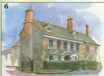
Manor Farmhouse. When built in the late 17th Century the Farmhouse would have been very close to open fields.