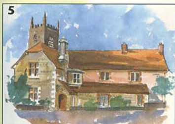
The Old Vicarage. The oldest house in Bicester. Built around 1500 so that the Vicar could live outside the Priory. It has a fine timber roof structure over what was originally an open hall.