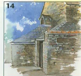
Town Lockup. This tiny 17th century prison its walls three feet thick, held local prisoners overnight before their journey to court.