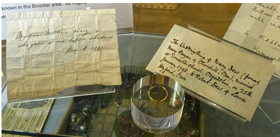
The Mary Dew wedding ring on display in the exhibition.

The Real Candleford Green Talk 18th July - 7:30pm see page 7