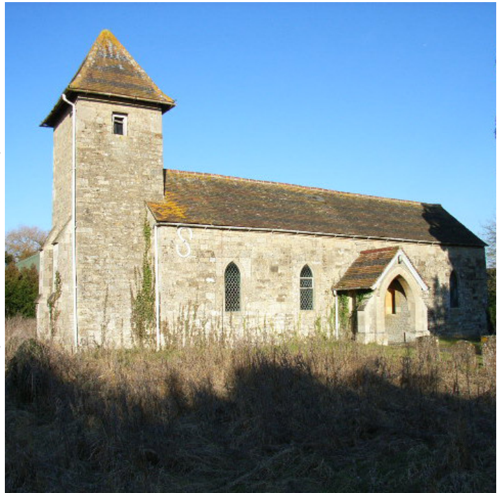
Holy Trinity Church

By 1665 the Rectory was a large house, assessed at six hearths for